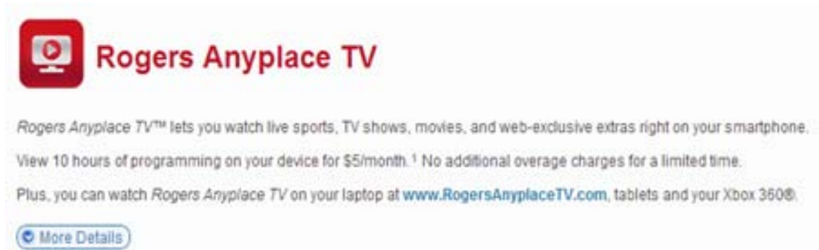
Figure 1 – Pricing details for Anyplace TV

Rogers offers to waive any overage fees incurred by customers for Anyplace TV viewing until April 1, 2014.